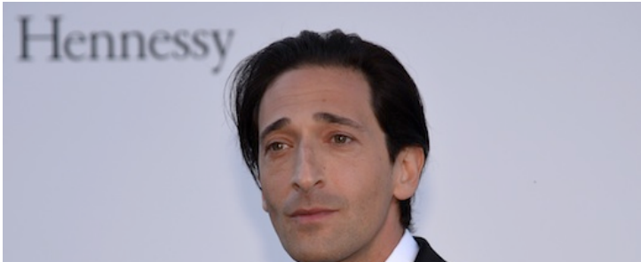
History Channel greenlights 'Houdini' miniseries with Adrien...