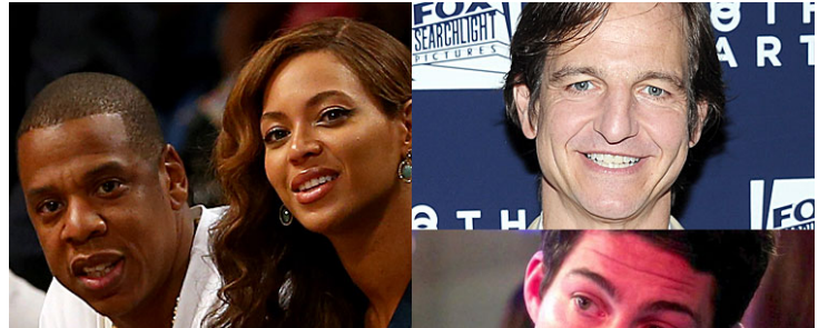
Beyonce-Jay Z concert gets HBO airdate; 'Hawaii Five-0,' 'Re...