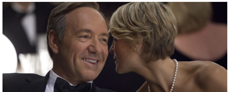
'House of Cards' Season 1 episode 1: 'Welcome to Washington'