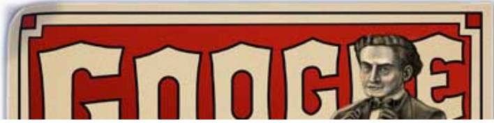
Harry Houdini gets his own Google Doodle