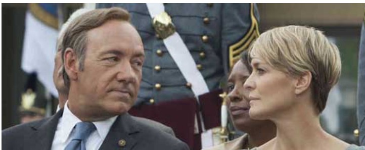
'House of Cards' Season 2 premiere date set for Feb. 14, 201...